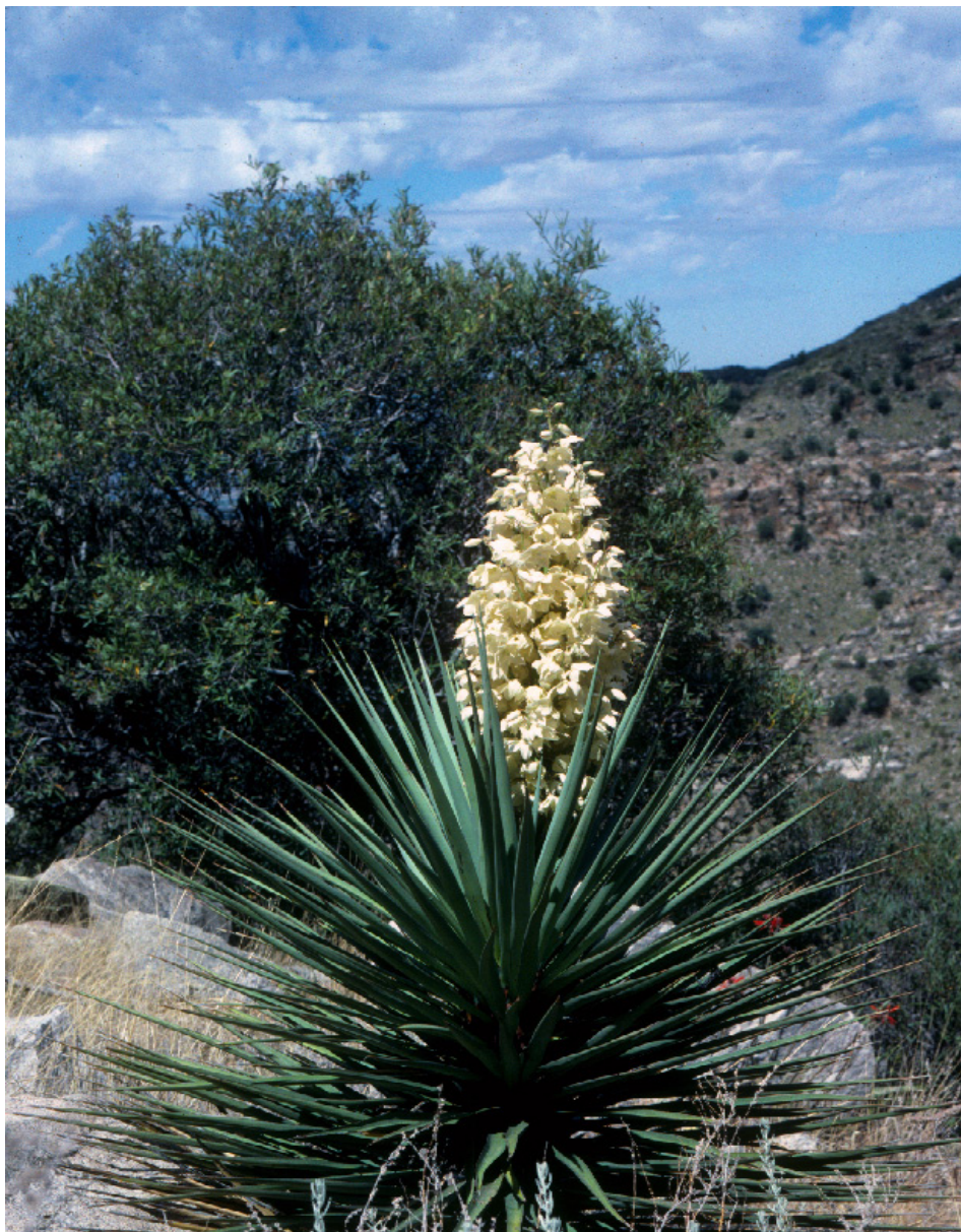
Figure 1. The Schott's yucca recently started blooming on the Finger Rock Canyon Trail. However, Bertelsen has only seen two in bloom through July 14. It is one of many species off to a slow start this summer.

Most phenological research occurs in temperate regions where plants bloom only once a year. In the Southwest, however, precipitation falls in two distinct periods, causing the landscapes to liven in March and April and in mid- to late summer. In the winter, flowering at lower elevations is prompted by precipitation, while plants at higher elevations are influenced more by temperature. In the summer, the cue is only rain.